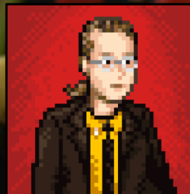
Mikko Hypponen F-Secure @mikko